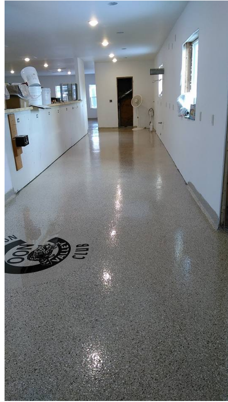
Work prior to and after the epoxy floor was installed.